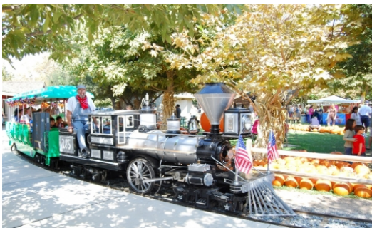
Irvine Park Railroad